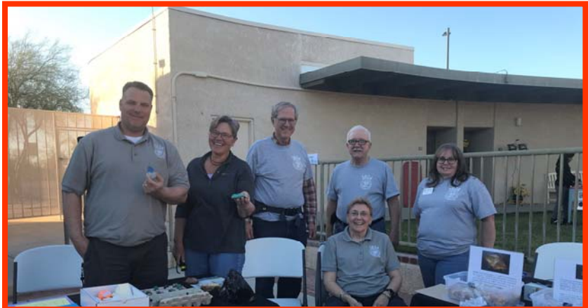
Family Science Night - St. Mark's Early Childhood Center