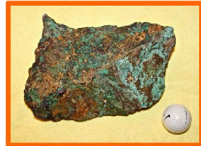
Photo #11 Chrysocolla, Malachite & Garnet Collected by Pattie Rose