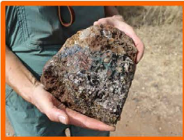
Photo #10 Chrysocolla, Quartz, Chalcopyrite & Galena Collected by Sara Alberts

featured very nice Chrysocolla specimens. (See photos # 10 - 12).